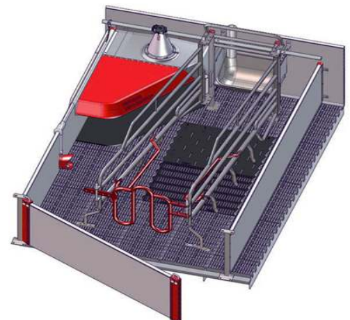
Hinged Farrowing Crates for Sows with Optional Creep Box for Piglets