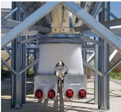
TWIN-STYLE (PANT LEG) TRANSITION

Chore-Time's single-style bin transitions are available in either translucent red or clear polycarbonate. Both help promote even feed flow and offer the ability to visually inspect the flow of feed to the auger system.