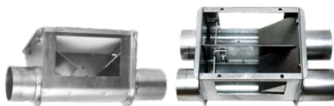
SINGLE AND TWIN METAL BOOTS

Chore-Time's twin-style (pant leg) transition features smooth, parabolic-curved sides formed with long-lasting polyethylene virgin materials and is opaque.