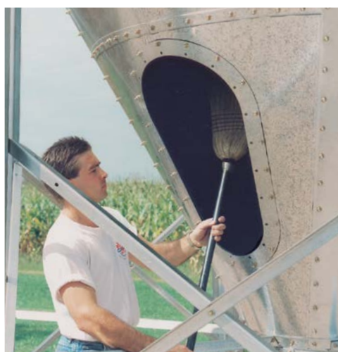
EASY GROUND-LEVEL BIN CLEAN-OUT