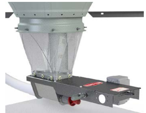
Single Boot Slide Actuator