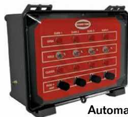
Automatic Bin Boot Slide Control

> The Chore-Time Automatic Bin Boot Slide Control can operate up to four bin boot slides. > An indicator light provides the ability to easily know if the auto bin boot slide is open or closed.