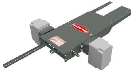
Twin Boot Slide Actuator