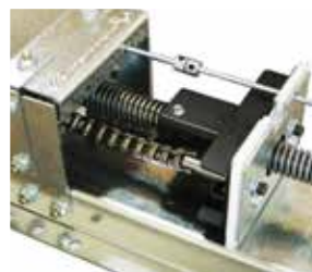
Two-piece plastic nut glides smoothly and is easy to replace.