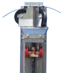
Cable Model LINEAR-LIFT™ Winch