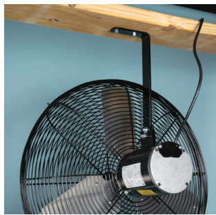
20-inch (508-mm) diameter basket fan with ceiling mount bracket.