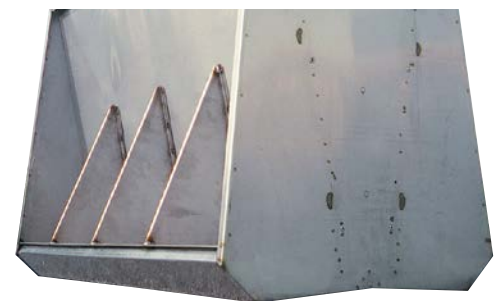
V-shaped bottom directs feed-clogging moisture away from the feed dispensing area.