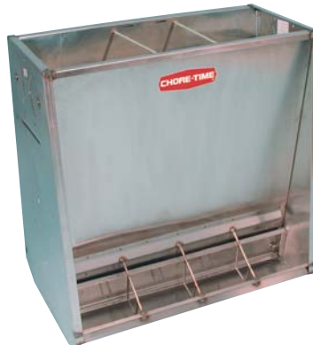
Nursery feeder with u-shaped bar guard divider.