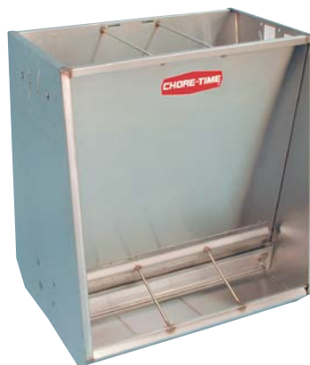
Finisher feeder with bar divider.