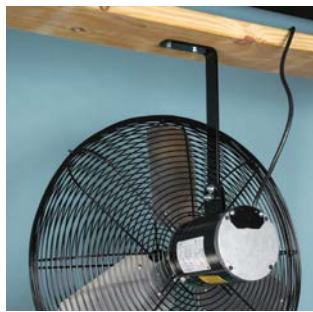
20-inch (508-mm) diameter basket fan with ceiling mount bracket.